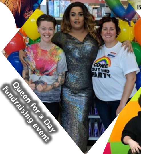
Queen for a Day fundraising event