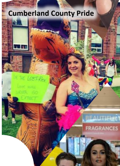
Cumberland County Pride