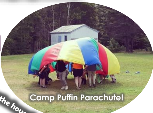
Camp Puffin Parachute!