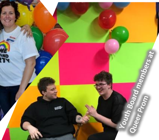
Youth Board members at Queer Prom