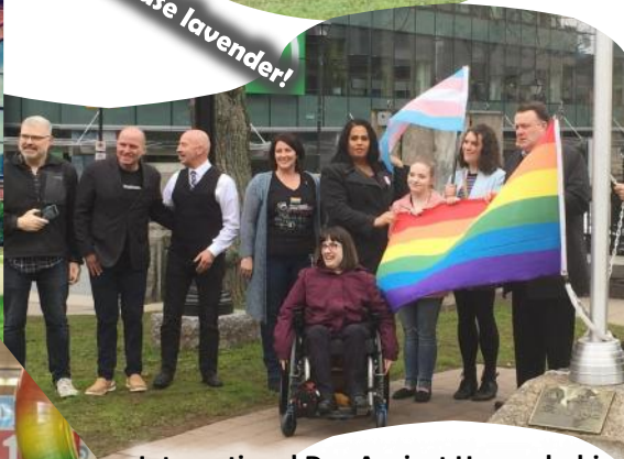
International Day Against Homophobia, Biphobia and Transphobia Flag Raising