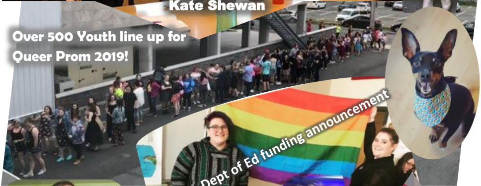
Over 500 Youth line up for Queer Prom 2019!