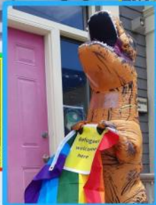
LGBT-Rex welcomes all!