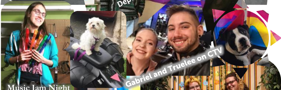
Music Jam Night