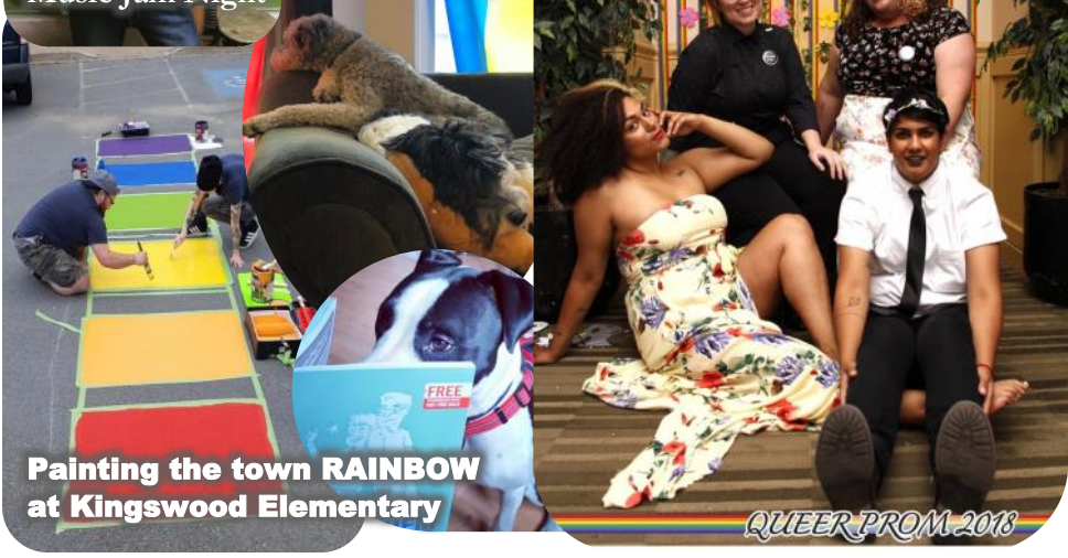
Painting the town RAINBOW at Kingswood Elementary